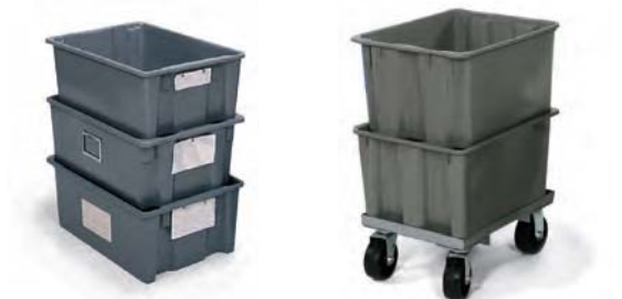
Identification Options (Snap-On and Adhesive Cardholders) (See pg. 39).