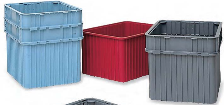
DC3120 with COL3000

Durable, clear covers with molded-in tabs on one side that hook under container lip to guide the cover into place. Ensures easy visual inspection of contents.