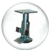
Includes Floor Lock