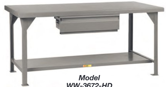
Model WW-3672-HD Shown with heavy-duty drawer